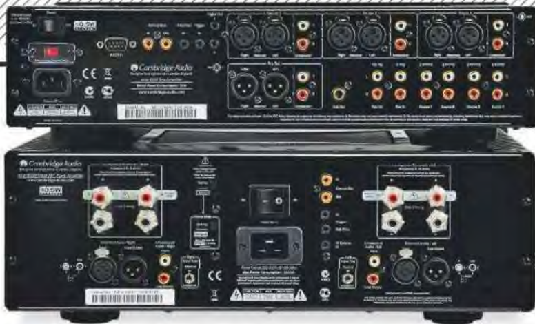
ABOVE: No shortage of analogue inputs here, with lots of single-ended (RCA) and balanced (XLR) options to choose from on the preamp [top]. The power amp can be set to stereo, mono or bridged mono, so you can add more amplifiers down the line

Readers may view comprehensive QC Suite test reports for the Cambridge Audio 851E preamp and 851W power amp by navigating to www.hifinews.co.uk and clicking on the red 'download' button. PM